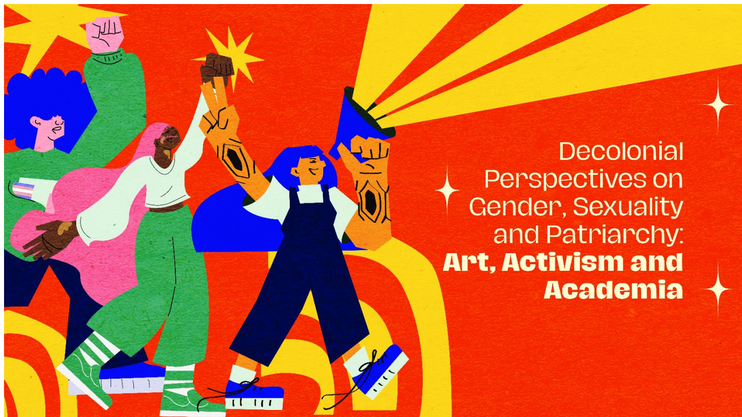
Art by: Auá Mendes